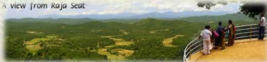
A view from Raja Seat

9:30 AM: Morning after break-fast proceed to Tala Cauvery where the river Cauvery starts. Then visit Bagamandala, Raja site, Aabi falls etc. Evening return back to hotel and over night stay at Coorg.